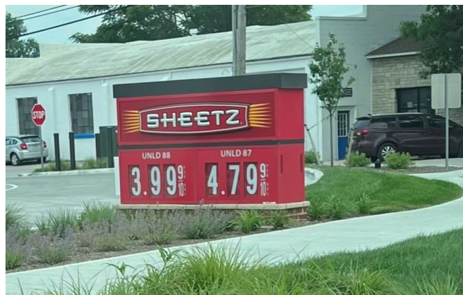
Sheetz, Grandview Heights, OH June 26, 2022

As we have noted previously, we continue to urge CARB to further develop clear policies that recognize the realities of today's fuel market and examine how homegrown biofuels can immediately contribute to achieving GHG reductions. Today, nearly all gasoline in California - and across the U.S. - is blended with 10 percent ethanol. E15, a blend consisting of 15 percent bioethanol, has been approved for use by the U.S. Environmental Protection Agency (EPA) in all passenger vehicles model year 2001 and newer, more than 96 percent of the vehicles on the road today, and is now for sale at more than 2600 locations in 31 states. In fact, this summer where available, we've seen E15 selling consistently for as much as $1 less per gallon than regular gasoline – that is meaningful consumer cost-savings.