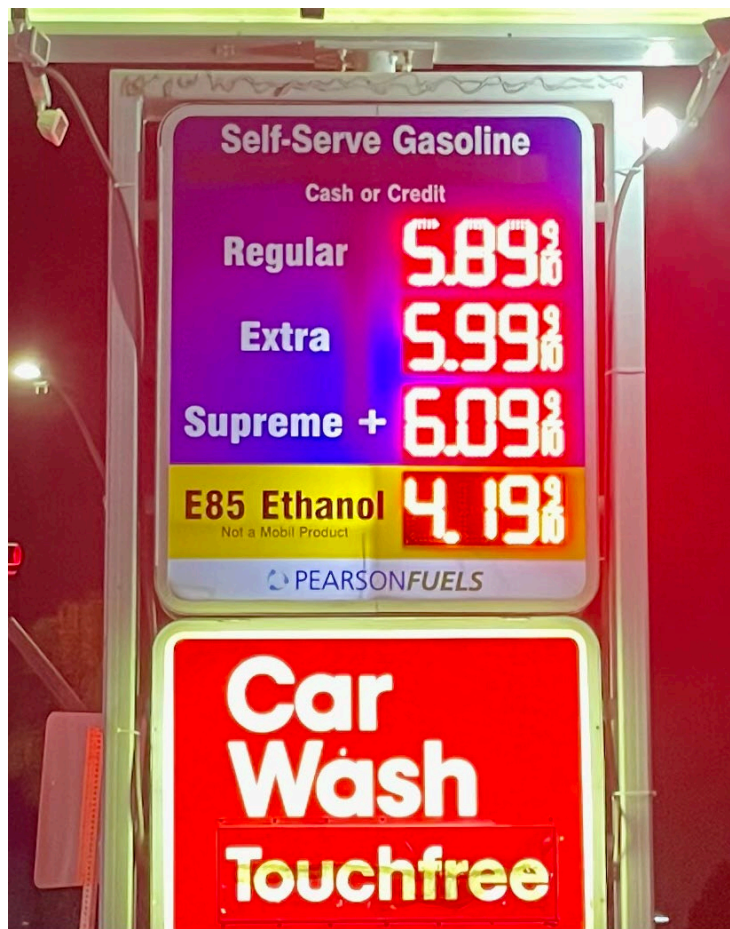
Mobil Station, San Diego, CA 4/6/2022

We would also encourage CARB and other state agencies to push for policies that strongly encourage and incentivize the use of higher bioethanol blends such as E15 and E85, the production and use of flex-fuel vehicles, as well as continued investment in infrastructure for the expanded use of E85.